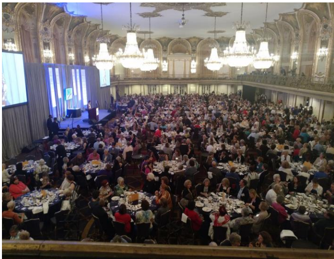
A scene from the National Convention in Chicago